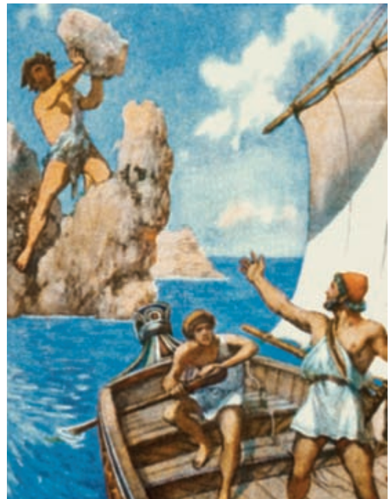
Detail of Odysseus and Polyphemus (1910), after L. du Bois-Reymond. Color print. From Sagen des klassischen Altertums by Karl Becker, Berlin.

This 1910 color print depicts Odysseus taunting Polyphemus as he and his men make their escape.