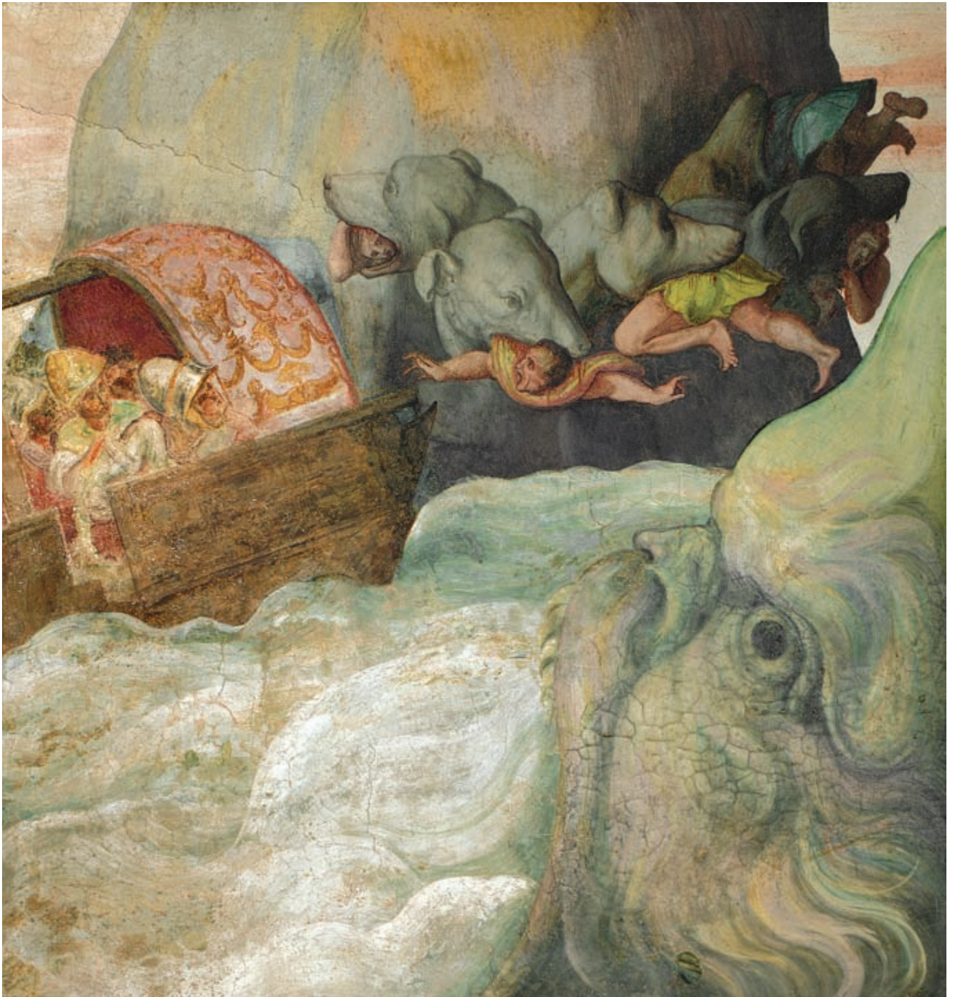
Scylla and Charybdis from the Ulysses Cycle (1580), Alessandro Allori. Fresco. Banca Toscana (Palazzo Salviati), Florence.