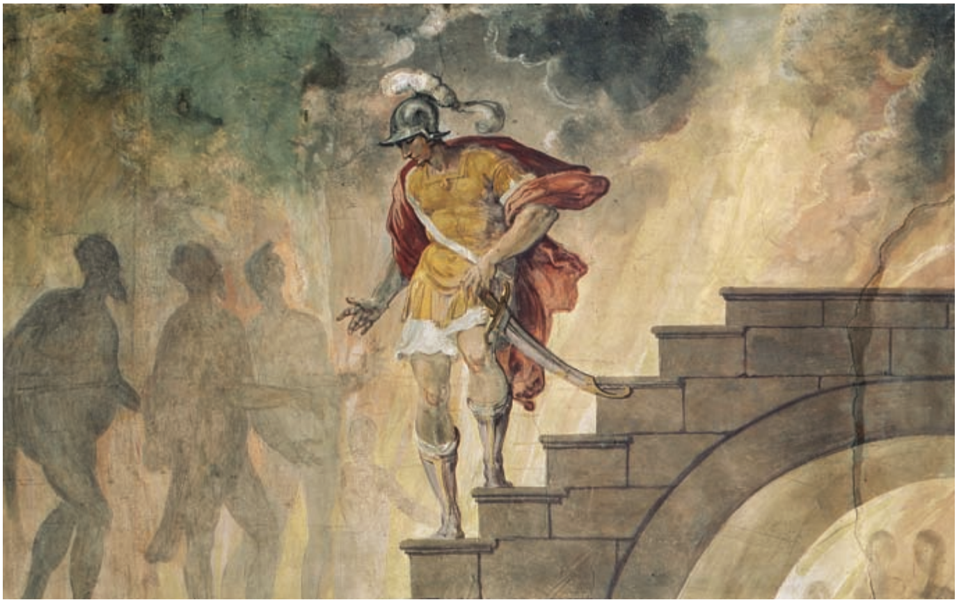
Ulysses Descending into the Underworld (16th century), Giovanni Stradano. Fresco. Palazzo Vecchio, Florence.

‘How is this, Elpenor, 30 how could you journey to the western gloom swifter afoot than I in the black lugger?’