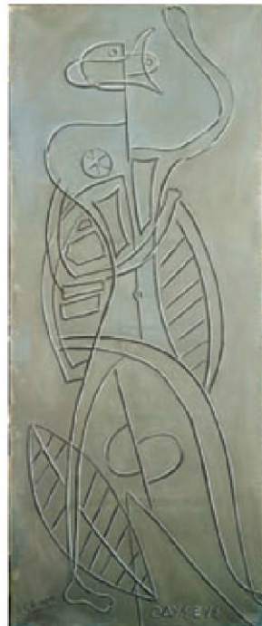
1931–1932: Ulysses , Georges Braque. Pastel drawing.

Narrative Art Most of the artwork in this selection tells a story in one way or another. Consider how the artist's choices affect your sense of the events portrayed in each work. Compare and contrast how these events are presented in visual form with how they are presented in the text.