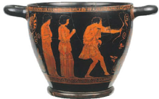
About 450–440 B.C.: Clay urn showing Odysseus slaying Penelope's suitors