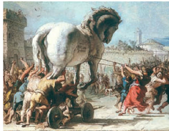
Giovanni Domenico Tiepolo's The Procession of the Trojan Horse into Troy , painted in 1773

After Hector's death, the Greeks brought the war to an end thanks to the cleverness of Odysseus, ruler of the island of Ithaca. To break the ten-year stalemate, Odysseus thought of a scheme to make the Trojans think that the Greeks had finally given up. He ordered a giant wooden horse to be built and left at the gates of Troy. The Trojans, waking to find it there—without a Greek in sight—assumed that the enemy had fled and left them a peace offering. They took the horse inside the city, only to discover, too late, that it was filled with Greek soldiers and that Troy was doomed.