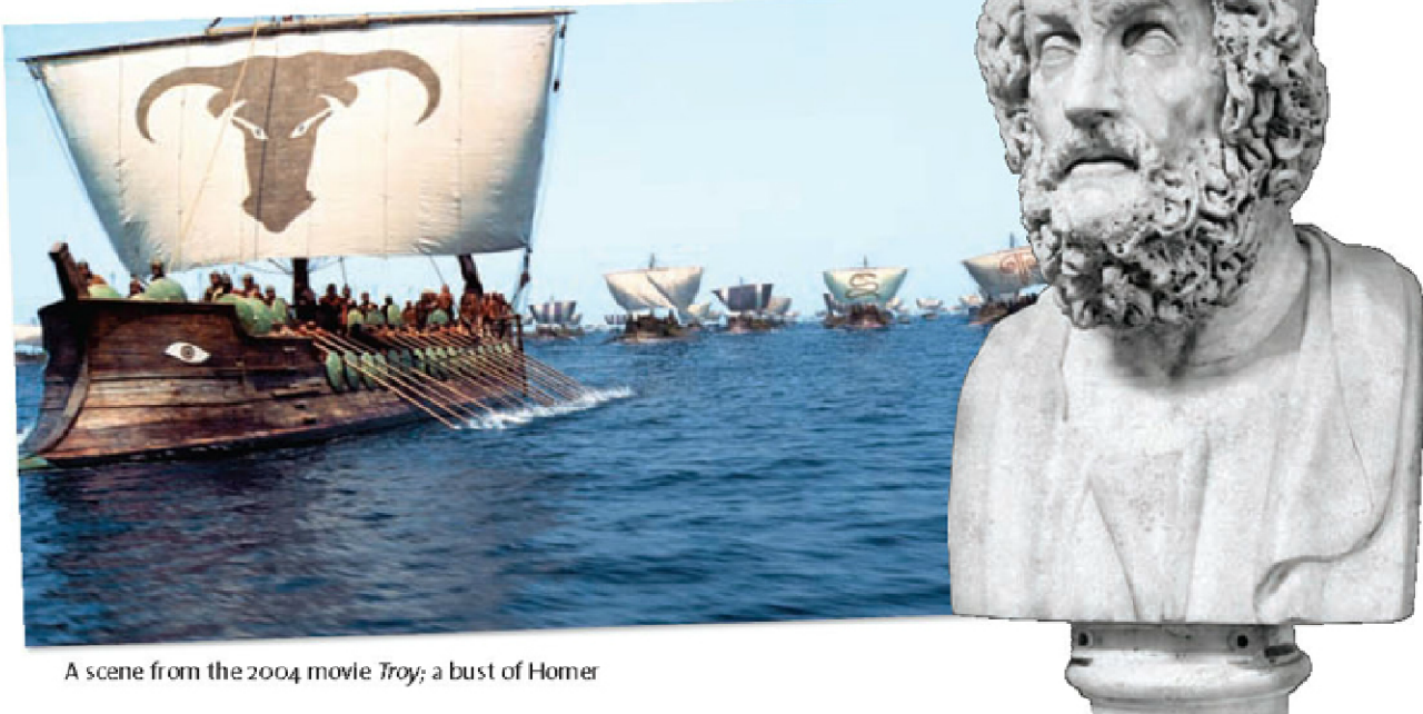
A scene from the 2004 movie Troy ; a bust of Homer