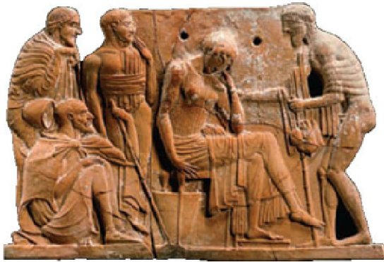
About 460–450 B.C.: Terra cotta plaque showing the return of Odysseus