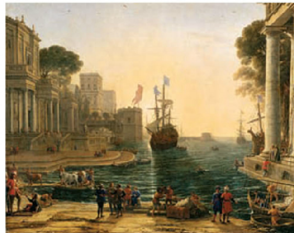
About 1650: Ulysses Returns Chryseis to Her Father , Claude Lorraine. Oil painting.